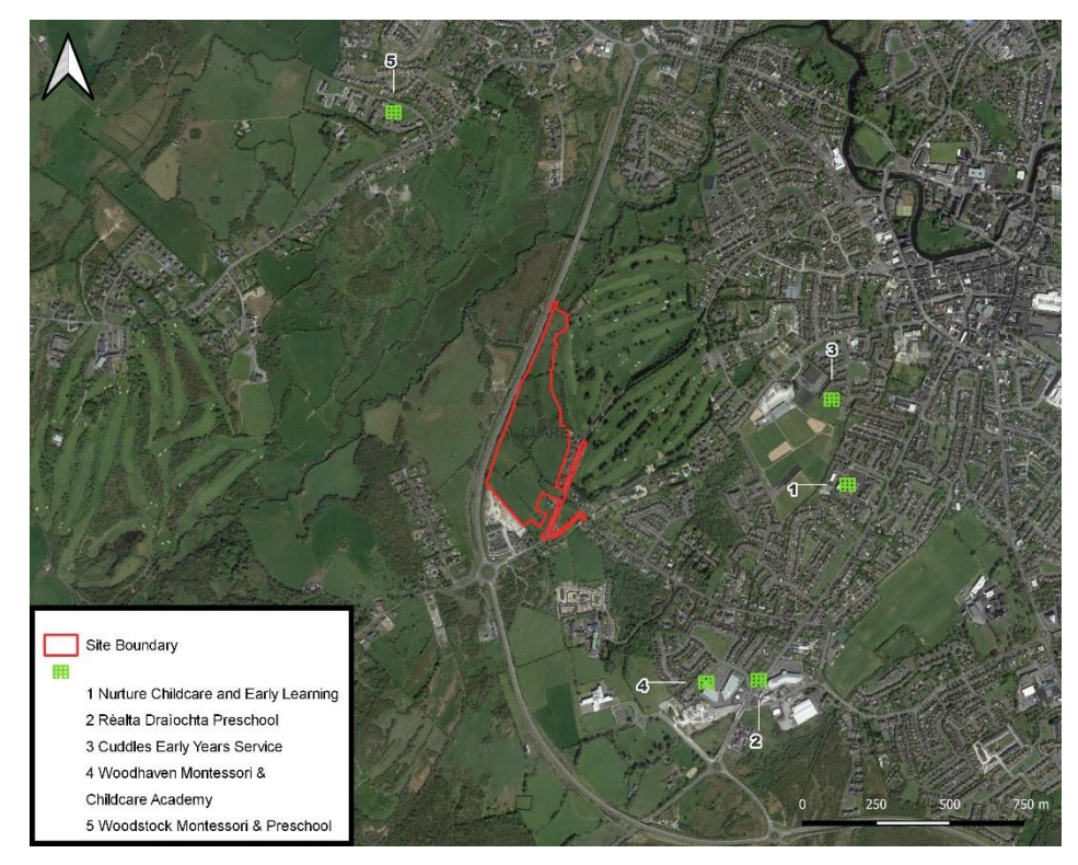
Fig. 3: Location of Childcare Facilities (site boundary outlined in red)

The study area is located within the settlement of Ennis which has many employment locations. It is considered reasonable that a sizeable proportion of those commuting may also avail of childcare facilities in these employment areas. Tusla regulatory inspection reports are available for all 5 identified facilities. However, not all the relevant data necessary to carry out the assessment was available within these reports. In the absence of this data, information in relation to the facilities was gathered by speaking directly with their proprietors in December 2021 and June 2022 who advised on the total capacity of the relevant facility and the corresponding number of available places.